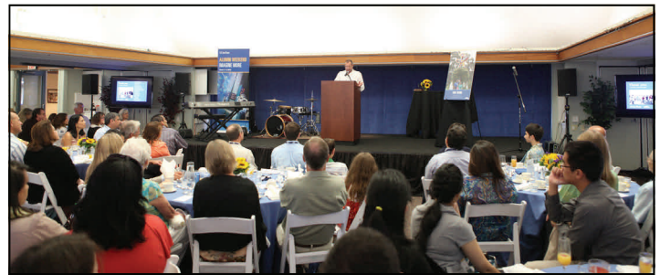
Alumni Weekend Brunch - June 9th